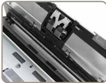
Robust Paper Handling