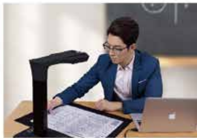
University / School