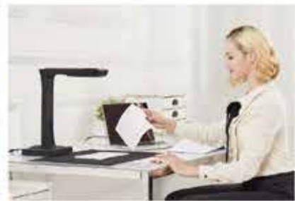
Accounting / Finance