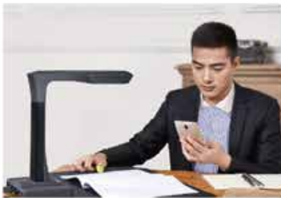
Law / CPA Firm

Scan book, magazine, drawing, picture, blueprint, receipt and so on.