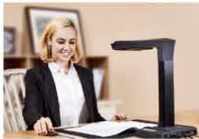
HR / Administration