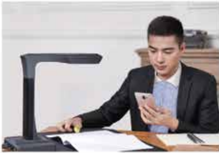
Law / CPA Firm

Scan book, magazine, drawing, picture, blueprint, receipt and so on.