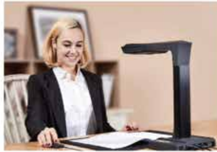
HR / Administration