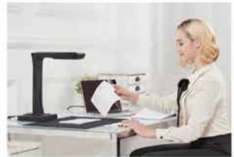
Accounting / Finance