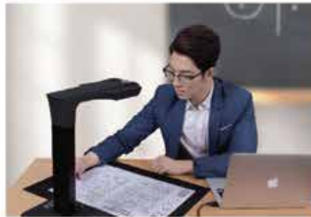
University / School